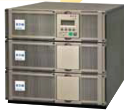
MX 10U Frame 5 kVA 4.5 kW 10 kVA 9 kW