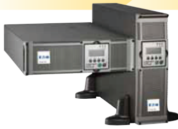
Eaton MX RT 5 kVA 4.5 kW