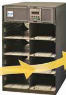
20 kVA 16U Frame