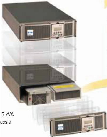
Standalone 5 kVA MX 3U chassis