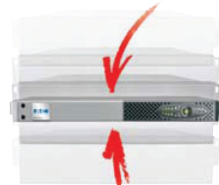
Up to 1550 VA of power is packed into 1U of rack space