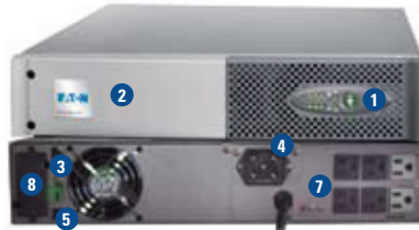
Evolution S 1250 VA