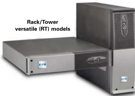
Rack/Tower versatile (RT) models