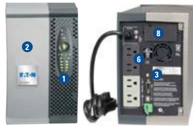
Evolution 850 VA

* Backup times are approximate and may vary with equipment, configuration, battery age, temperature, etc.