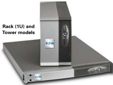
Rack (1U) and Tower models