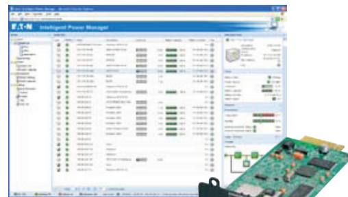
Network Management Card and Intelligent Power Manager supervisory software