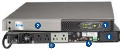
Evolution 650 VA