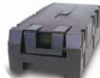
Battery module (two per slot)