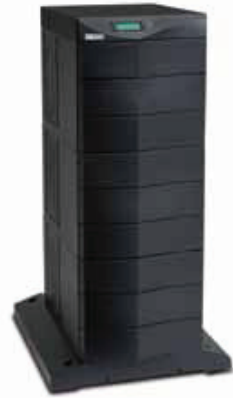
9170+ 9-slot configuration