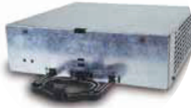
3 kVA power or charger module (one per slot)